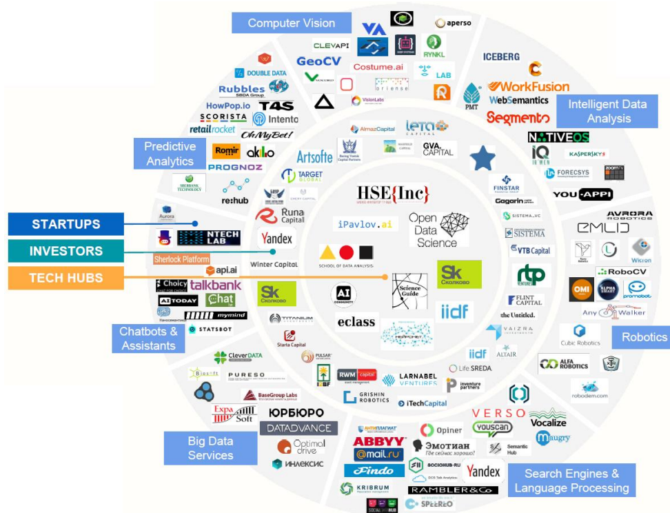
Figure 1 – Russian AI investors

Figure 1 below shows Russia’s AI investor landscape as of 2017.